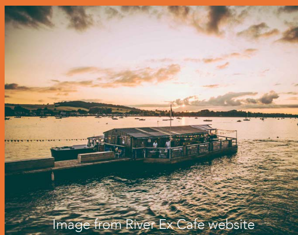
Image from River Ex Cafe website